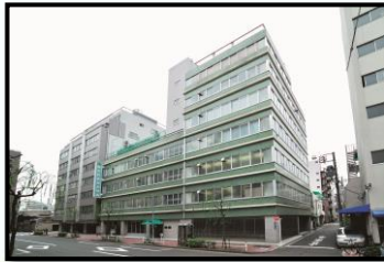
Hong Kong / China Nakagawa H.K. Limited.