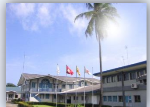
Tropical Findings (PVT) Limited