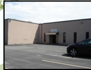
USA Snow and Stars Corporation