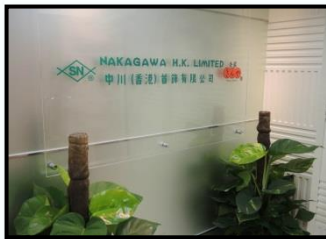
Hong Kong / China Nakagawa H.K. Limited.