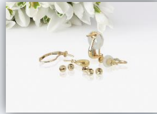
Jewellery & Accessory Components