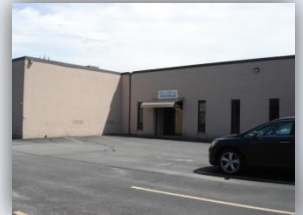
Snow and Stars